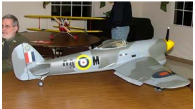
Model of the Month. Hawker Typhoon, scratch built by Gene Blasavage. Saito 120 up front.