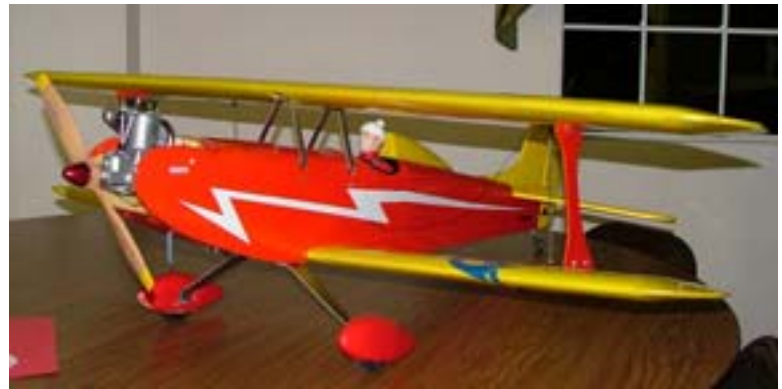
Sig Hog Bipe with Saito 100 by David Vilbig