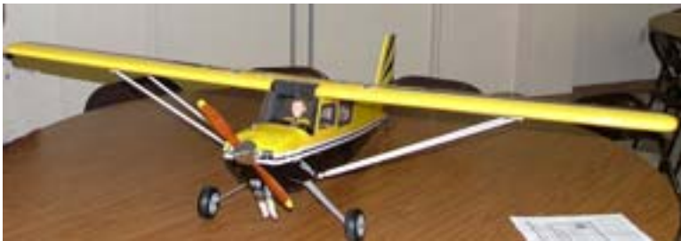
Global Citabria with an OS 46 by Larry Buckwalter