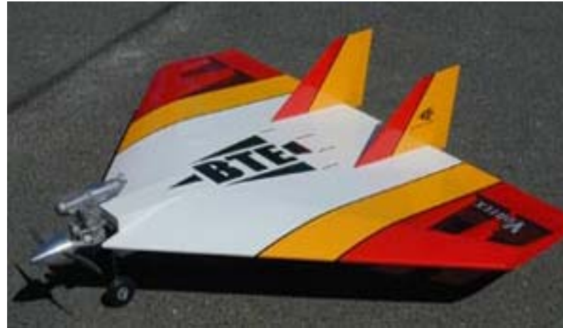
Bruce Tharpe Engineering Delta Vortex with Super Tigre 90 by Dick Lessard