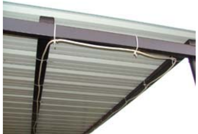
How many fields have their very own mister?