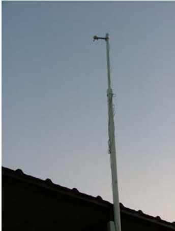
Our electronic wind speed indicator is operational. Like we didn't know it was windy...